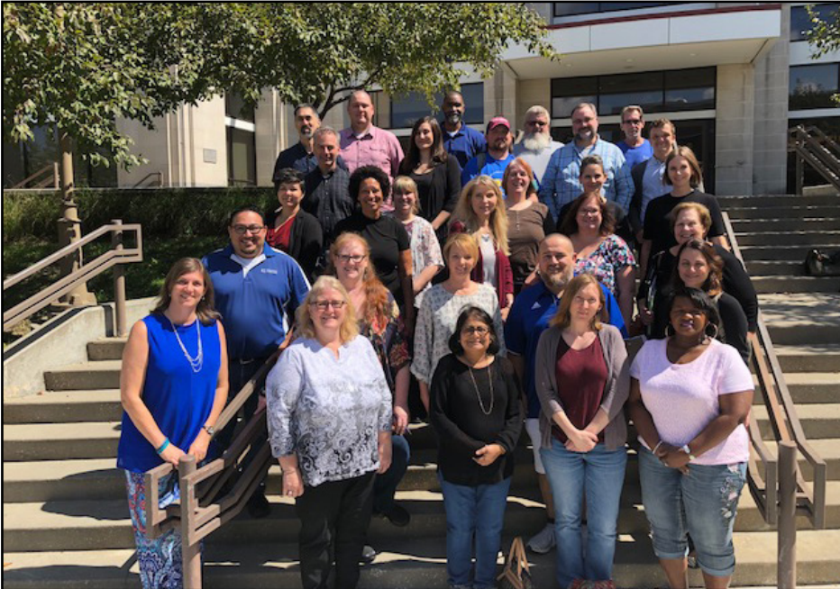
Pictured: Members of the 2018-2019 Staff Senate